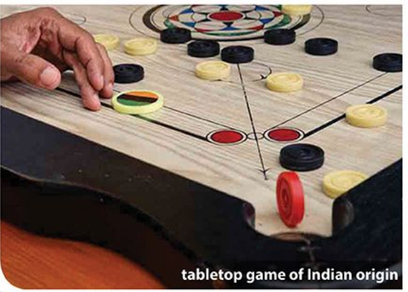
tabletop game of Indian origin