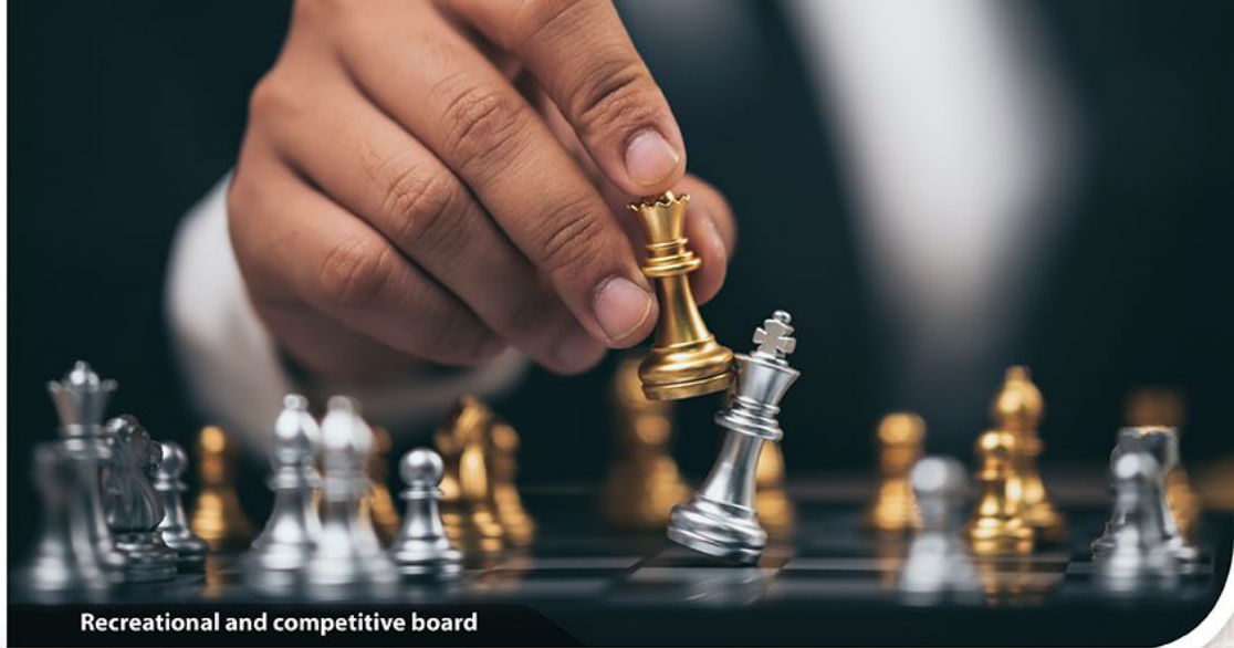
Recreational and competitive board